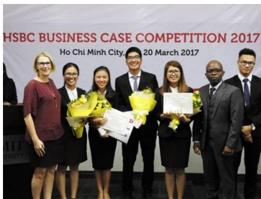
Woohoo - RMIT Vietnam (HCMC)