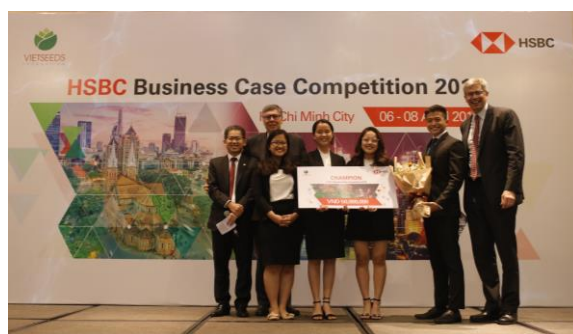
The Champion of HSBC Business Case Competition 2019