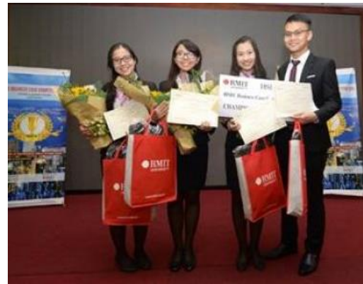
Young Buffalo - RMIT Vietnam (HCMC)