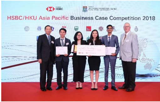
The Outliers - RMIT Vietnam (HCMC)