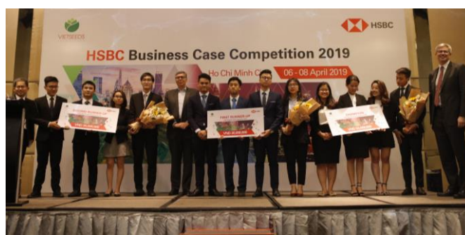
Top 3 of HSBC Business Case Competition 2019