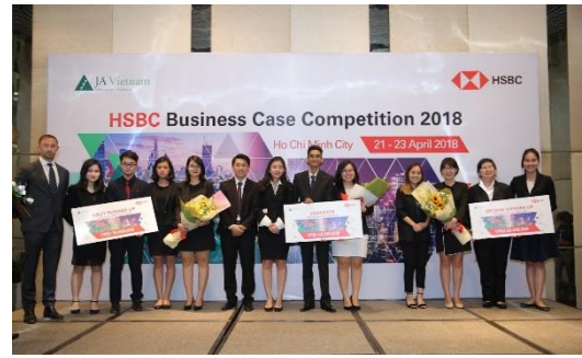
Top 3 of HSBC Business Case 2018